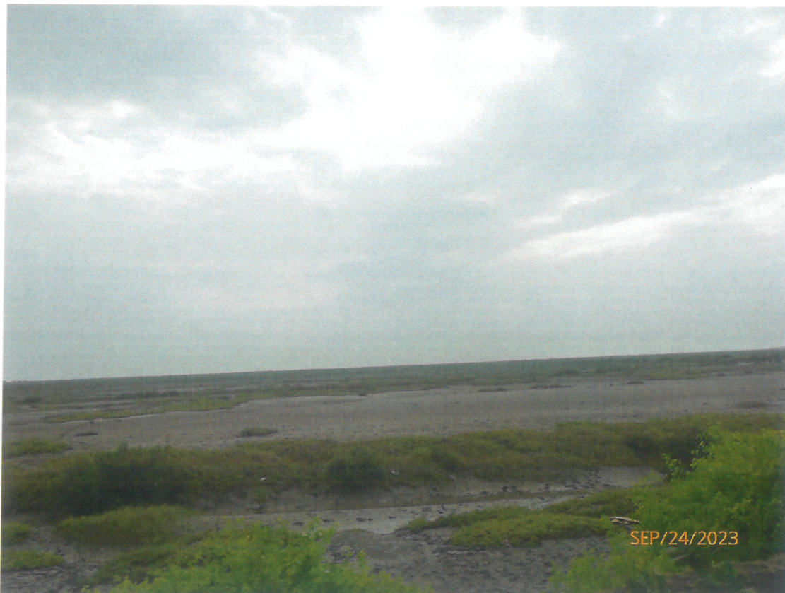
Plate 1: A view of creek near to Proposed Project Site