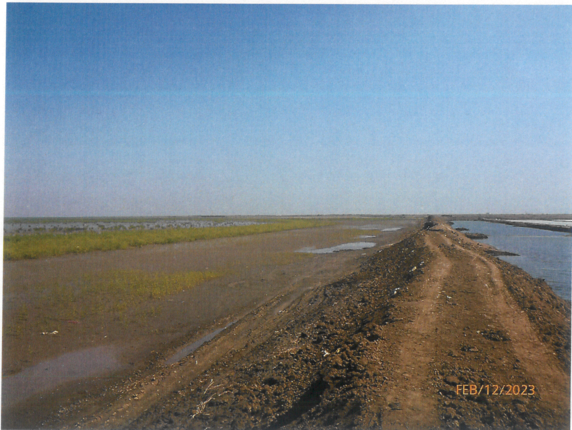
Plate 4: Mangrove, Intertidal Zone and Saltpan