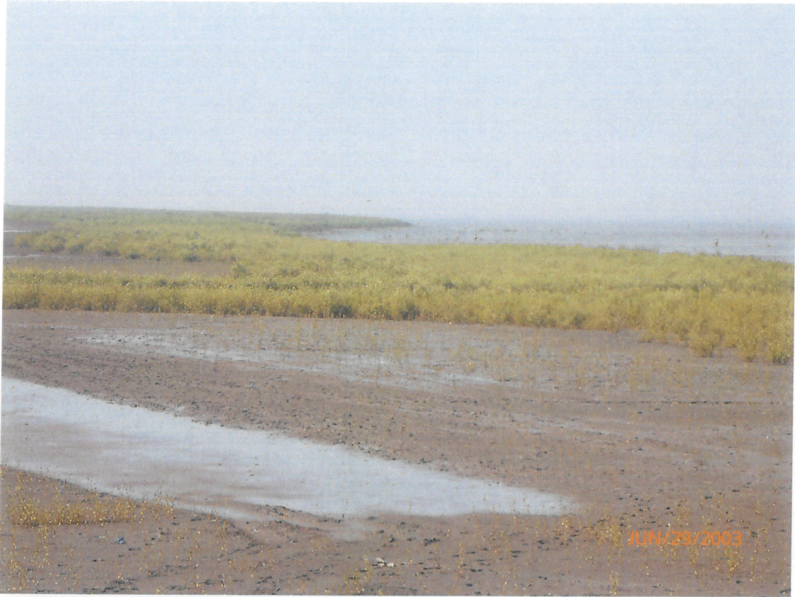
Plate 3: Mudflat with Mangroves