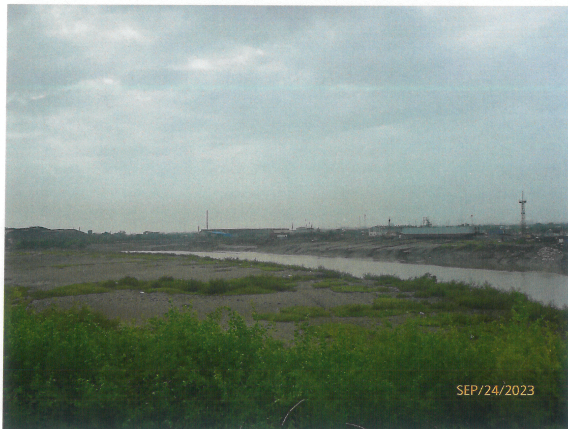
Plate 2: Another view of creek near to Proposed Project Site